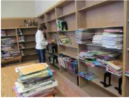
Community United Elementary School/Futures Elementary School in 2012 and in 2016