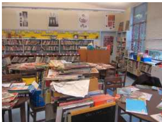
Global Family Elementary in 2012 and in 2016