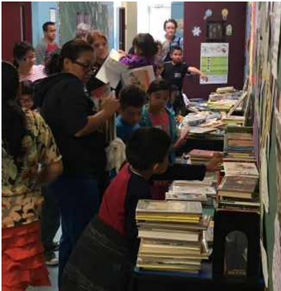
Global Family Elementary School

Owning books is fundamental to increasing literacy for children. FOPSL collected thousands of books to give away at Family Literacy Events.