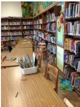
Bella Vista Elementary School in 2014 and in 2016