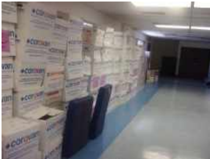
Rise Community/New Highland Elementary School in 2013 and in 2016.