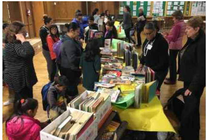
East Oakland Pride Elementary School