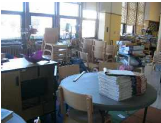
Fruitvale Elementary in 2011 and in 2016

Over the last five years, FOPSL has worked tirelessly to help OUSD open library doors and advocate for a district policy and funding to keep library doors open. This collaborative endeavor has been made possible by numerous volunteers, businesses, foundations, individual donors, community-based organizations, principals, parents, OUSD library staff, OUSD board of education and OUSD administration. In celebration of our fifth anniversary we share a few photos of OUSD libraries that are thriving because of this work.